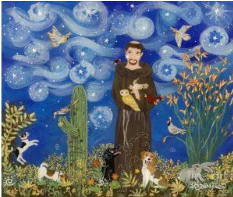
St. Francis of Assisi video from Catholic Online